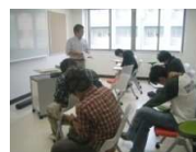
Sometimes used for English classes

A new room for talking and chatting in English has opened at the middle wing of Aidai-Muse, 2 nd floor, in front of the Student Self-Learning Room. This room is opened to students who want to talk in English and improve their English speaking skills. This room is also used for English conversation classes such as "Talk! Talk! Talk!" and the English recitation group, "English Gang". When there are no activities in this room, English news programs like CNN, ABC, BBC are on the TV, so you can pop in and see what's happening in the world in English. It is a good way to improve your listening skills, too.