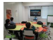
World news is on a big screen