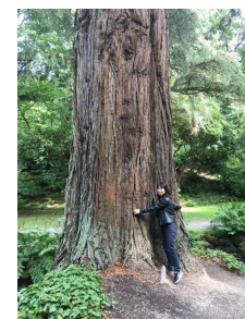
At Bodnant Garden

Also, I enjoyed homestay very much. At first I was worried whether it would work or not, but I got to know my host family quickly. They always cared about me asking how school was, and if I slept well. They talked to me. Besides that, it was fun to talk about a lot about Japan, the U.K., and each other. They made delicious food every day, corrected my English grammar and pronunciation, and did not interrupt me because of my English ability. After school and on holidays, they took me to many places such as English gardens, the sea and movies. It was really nice to be with them.