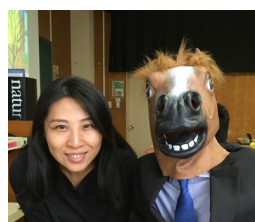
Me with a Student on the Halloween Day

Above all, I appreciate all your kindness during the interaction and communication with me. I wish you all the best and good luck for the future. Have a dream and fight for it!