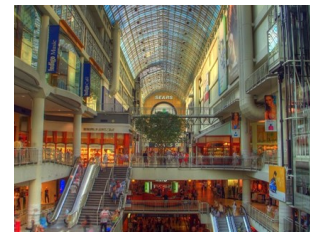
Eton Centre (has huge food court)

As for the food culture, since Canada is multicultural, it's very convenient and fun to choose meals. It's mainly because there are a lot of ethnic towns everywhere, Cabbage (Ireland), China, Greek, Brazilian, Arabian, Portugal, etc. Ordinarily, people say the quality of meals in Canada is pretty close to the ones in their home countries, so they are kind of like reminders for those, I believe.