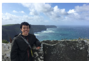
At the Cliffs of Moher

First, through my daily life in Ireland, I learned about Irish culture. The Irish eat potatoes every day like the Japanese eat rice every day. The main means of transportation is a double-decker bus. However, it was rare for it to come on time. Second,