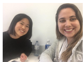
In a class

In the first place, the weather condition is relatively adaptable. Particularly in winter, it is freezing outside, but as long as you get prepared with appropriate clothing, it would be even enjoyable. Also, especially on weekends, lots of events such as TIFF (Toronto International Film Festival), Christmas market and parade, Jazz festival, etc. would come up, so you cannot miss them!