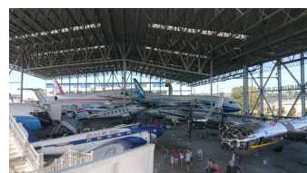
The Museum of Flight

First of all, I could visit The Museum of Flight and Boeing Everett Factory. I had heard Seattle is very famous for Aeronautical engineering, so, I absolutely wanted to go there. When I went there, there were more airplanes outside the factory than at the airport, and the Boeing factory was really big. One of the reasons is that the airplanes are built there. From what the tour guide said, it is the largest building in the world. From looking at the building, I believe that it is true.