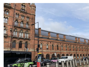
King's Cross Station, London

Not everything was a piece of cake, but I managed to work out everything in the end. Having eaten okonomiyaki at the airport, I stepped into the plane off to London.