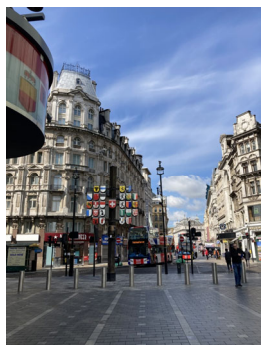
Leicester Square, London