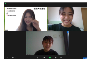
Me (upper right) having discussion with volunteers